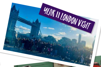
YEAR 11 LONDON VISIT