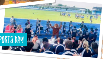
OUR ANNUAL SPORTS DAY