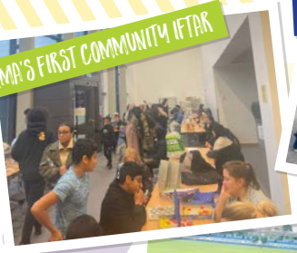
TEMA'S FIRST COMMUNITY IFTAR