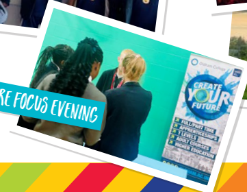
KS4 FUTURE FOCUS EVENING