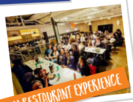
YEAR 11 RESTAURANT EXPERIENCE