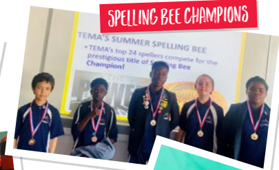
SPELLING BEE CHAMPIONS