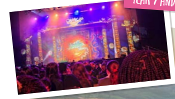
YEAR 7 AND 8 PANTOMIME