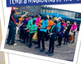
TEMA'S MUSICIANS AT THE MANCHESTER FESTIVAL